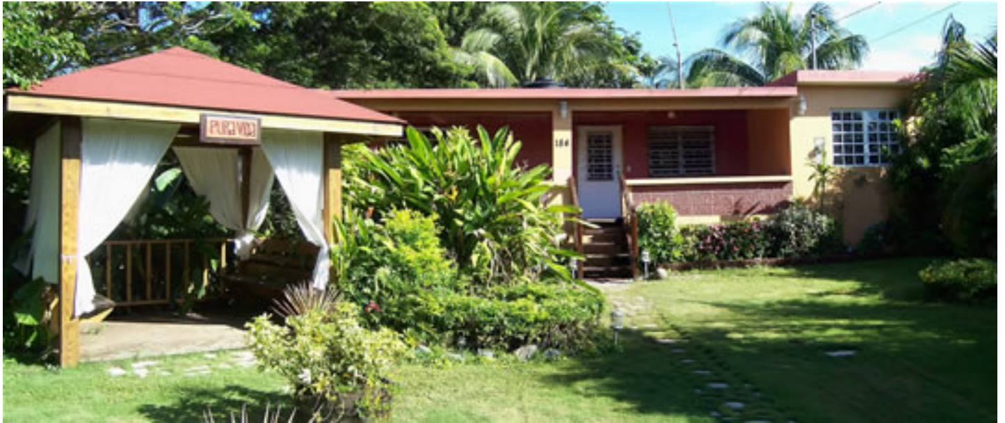
Pura Vida as seen from Calle Liria